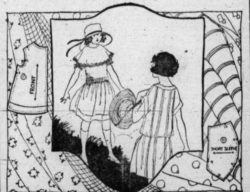
New McCall Patterns 2712 and 2687